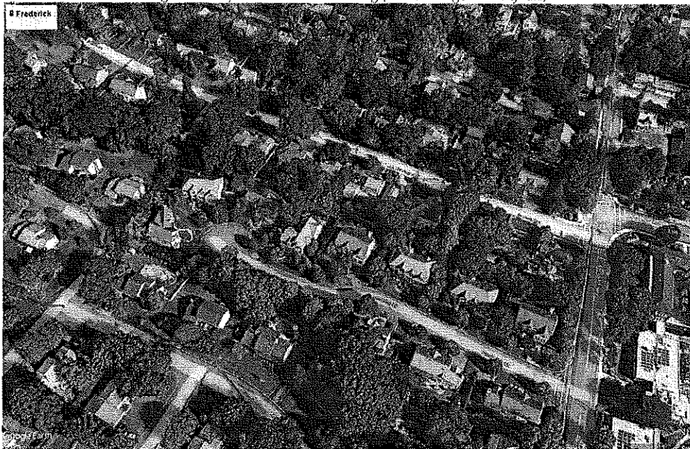
Figure 2: Subject site with property boundaries approximated.