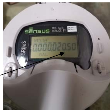
Digital Totalizing Meter

Totalizer advances for very low flow rates (less than 1/4 gallon per minute). Open and close lid to display instantaneous flow rate (gallons per minute).