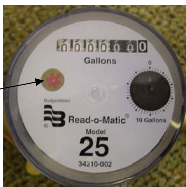
Digital Totalizing Meter

LEAK INDICATOR rotates even for very low flow of water.